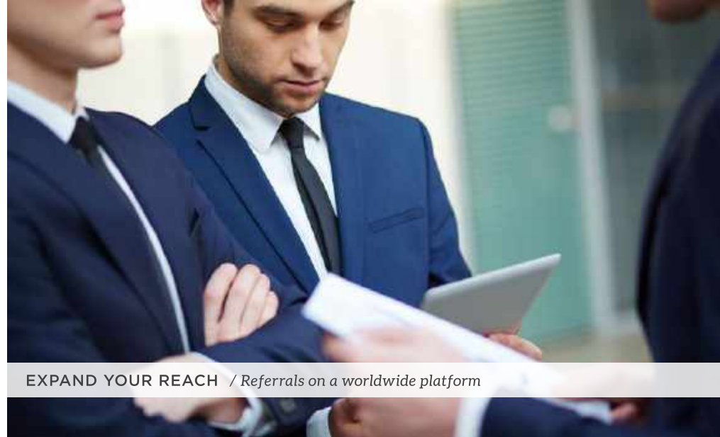
EXPAND YOUR REACH / Referrals on a worldwide platform