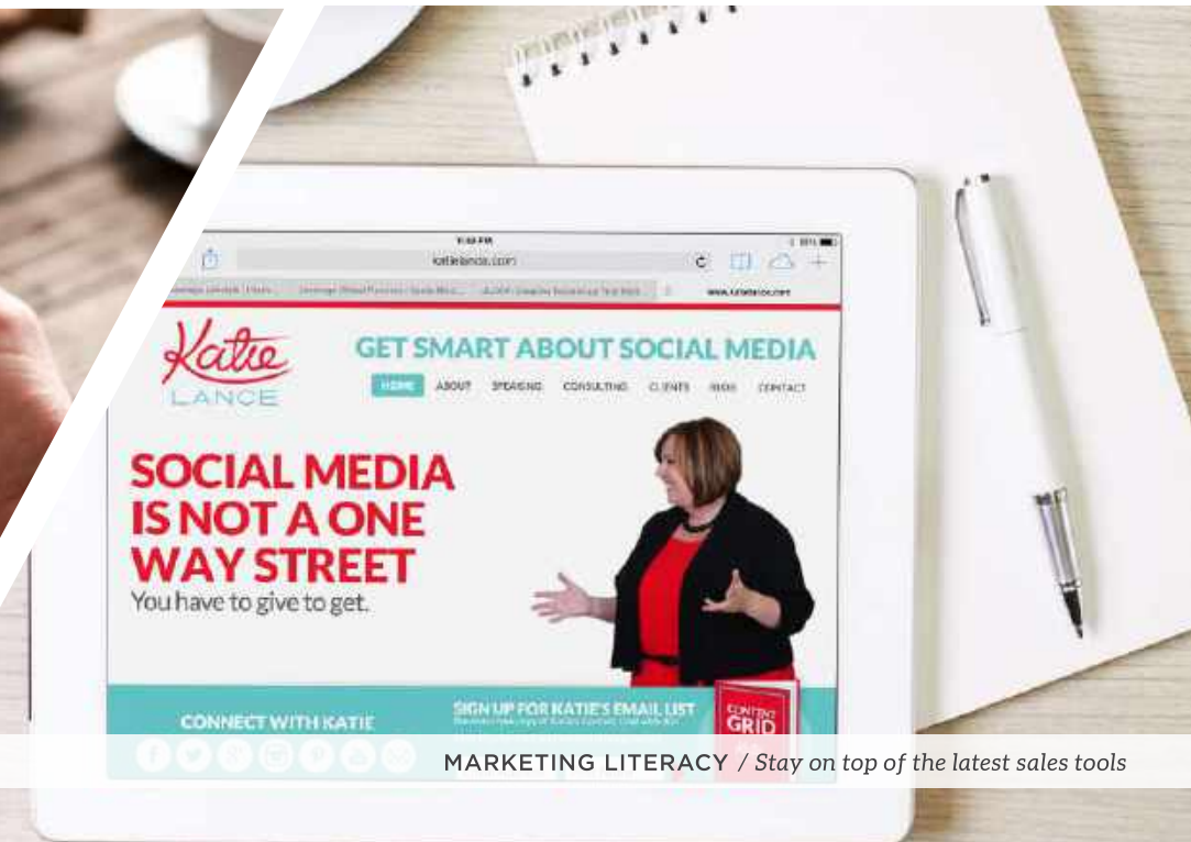
MARKETING LITERACY / Stay on top of the latest sales tools