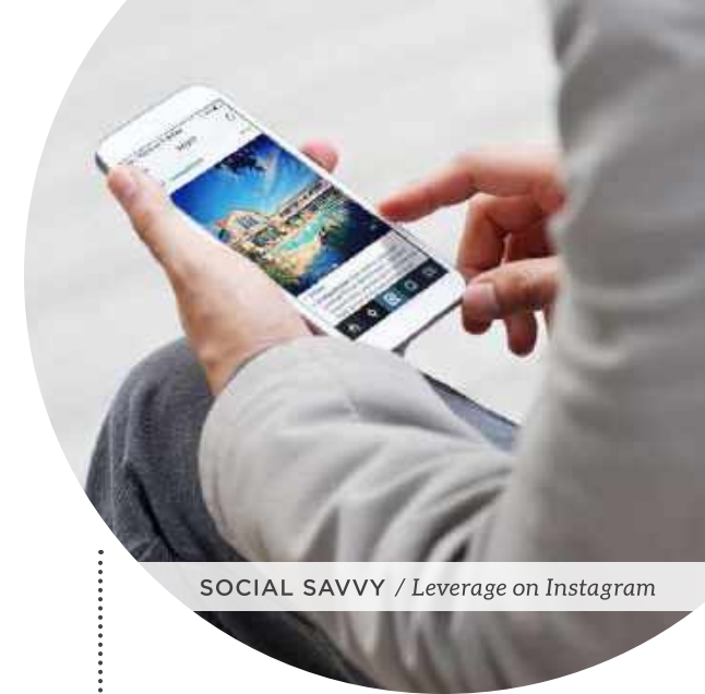
SOCIAL SAVVY / Leverage on Instagram